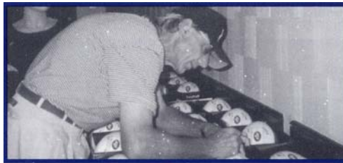
Joe Namath Signing Commemorative Footballs.